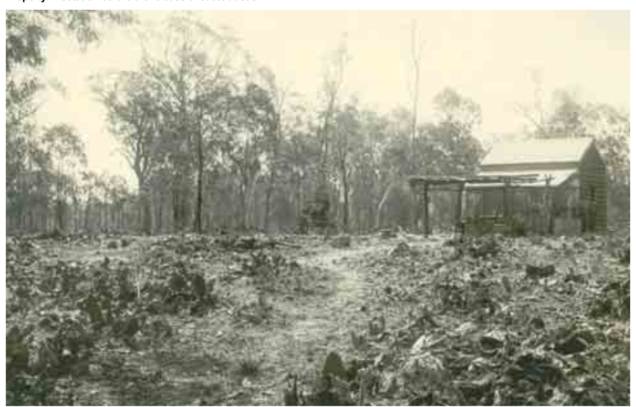
Same property following cactoblastis release

Fact sheets are available from DPI&F service centres and the DPI&F Information Centre phone (13 25 23). Check our web site <a href="www.dpi.qld.gov.au">www.dpi.qld.gov.au</a> to ensure you have the latest version of this fact sheet. The control methods referred to in this Pest Fact should be used in accordance with the restrictions (federal and state legislation and local government laws) directly or indirectly related to each control method. These restrictions may prevent the utilisation of one or more of the methods referred to, depending on individual circumstances. While every care is taken to ensure the accuracy of this information, the Department of Primary Industries and Fisheries does not invite reliance upon it, nor accept responsibility for any loss or damage caused by actions based on it. © The State of Queensland (Department of Primary Industries and Fisheries) 2007