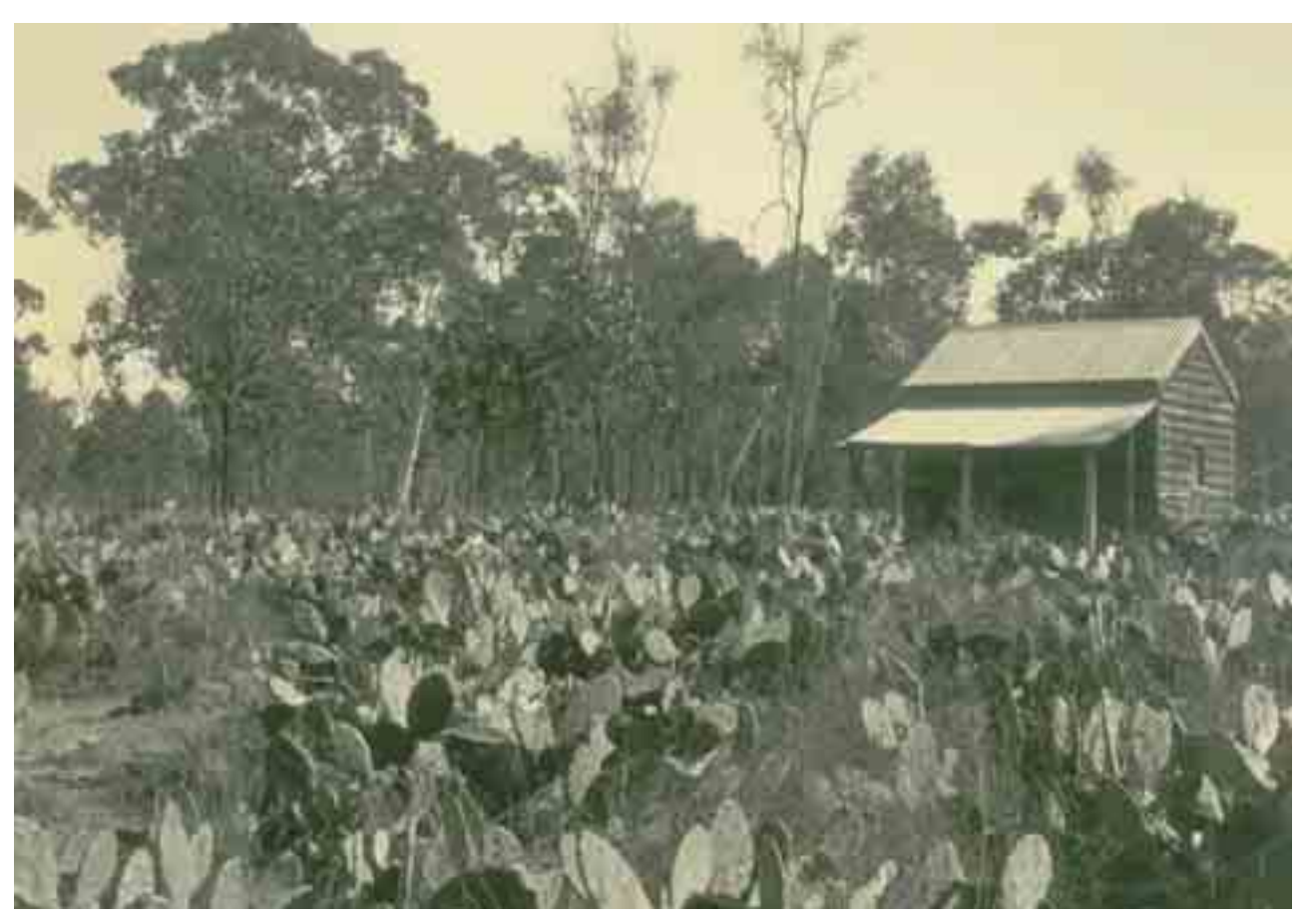
Property infestation before the release of cactoblastis