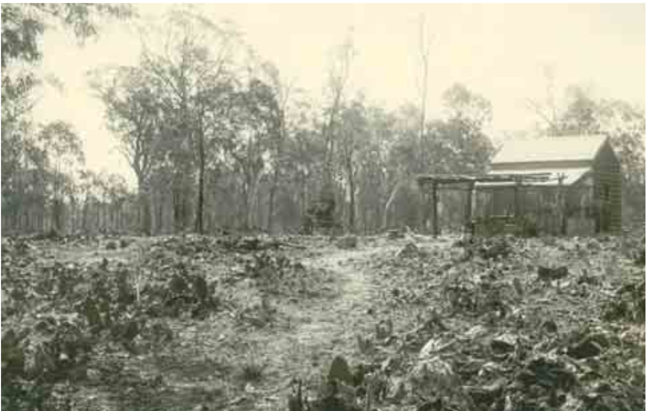
Same property following cactoblastis release

Fact sheets are available from DPI&F service centres and the DPI&F Information Centre phone (13 25 23). Check our web site < www.dpi.qld.gov.au > to ensure you have the latest version of this fact sheet. The control methods referred to in this Pest Fact should be used in accordance with the restrictions (federal and state legislation and local government laws) directly or indirectly related to each control method. These restrictions may prevent the utilisation of one or more of the methods referred to, depending on individual circumstances. While every care is taken to ensure the accuracy of this information, the Department of Primary Industries and Fisheries does not invite reliance upon it, nor accept responsibility for any loss or damage caused by actions based on it.