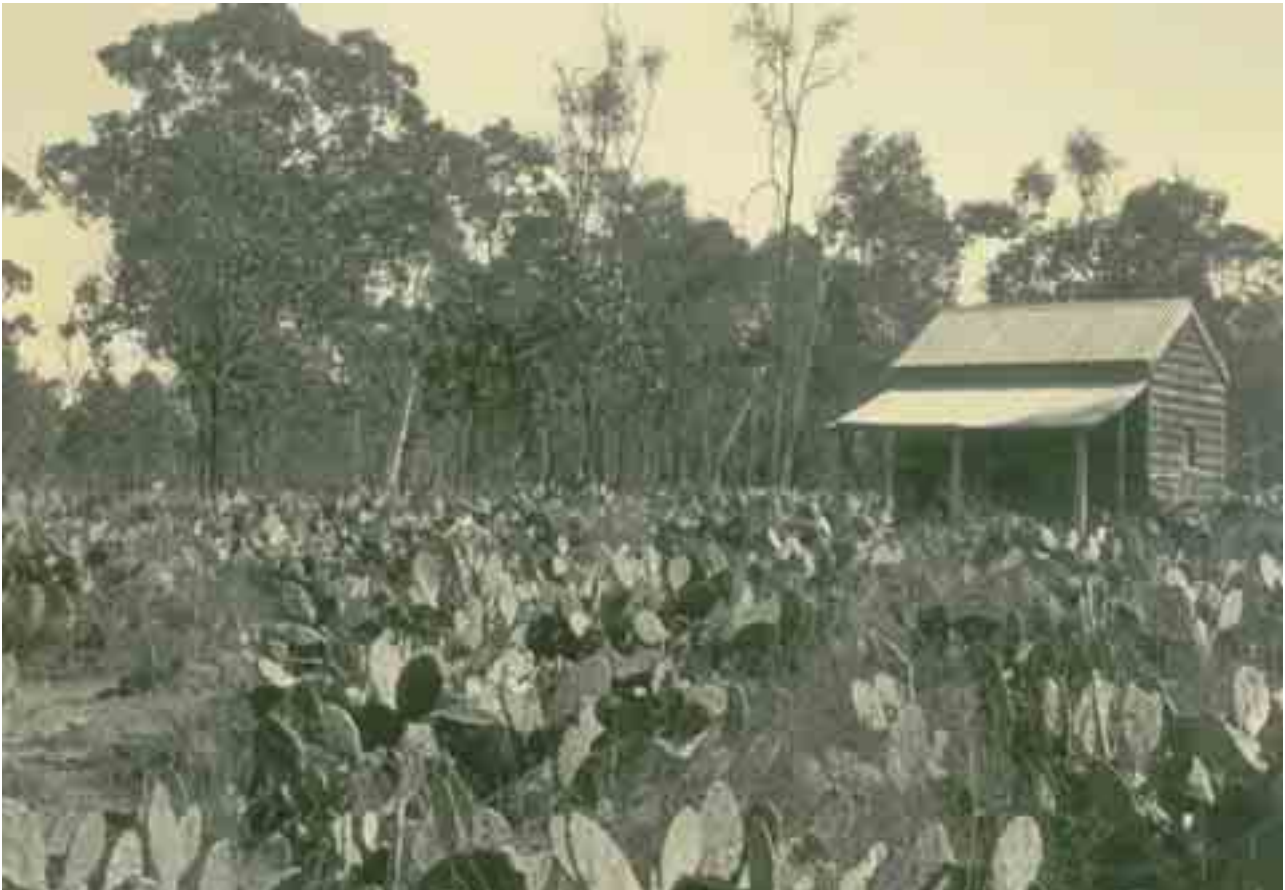
Property infestation before the release of cactoblastis